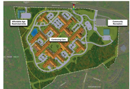
ERICKSON LIVING AT BRADDOCK – FAIRFAX, VA

The Board of Supervisors Hearing is on July 16, at 3:30 in the Government Center Auditorium. This is the final step in the process for this project.